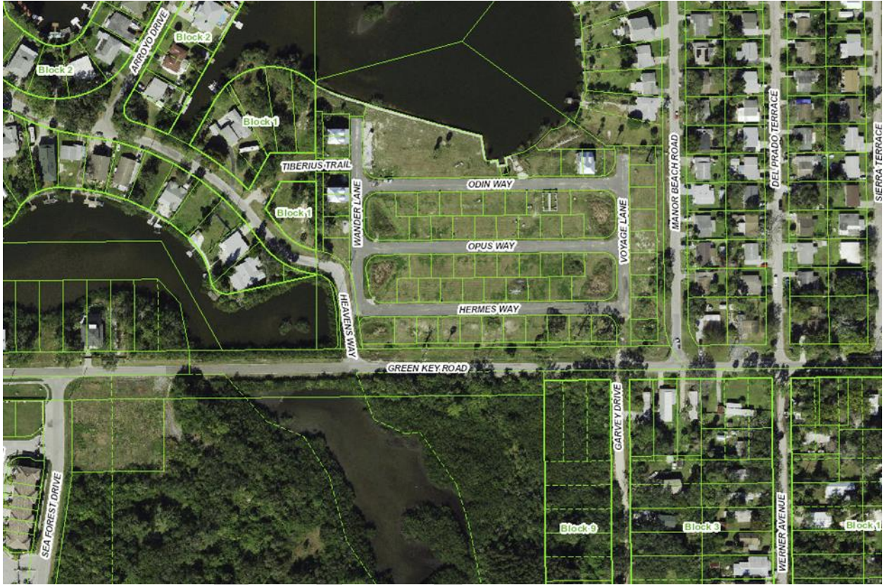
EXHIBIT A LOCATION MAP