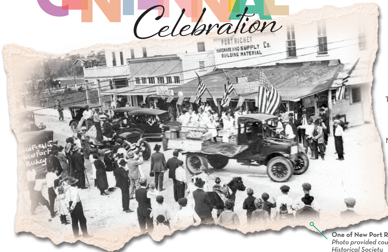
One of New Port Richey's First Chasco Parades.