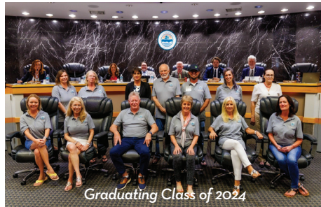
Graduating Class of 2024