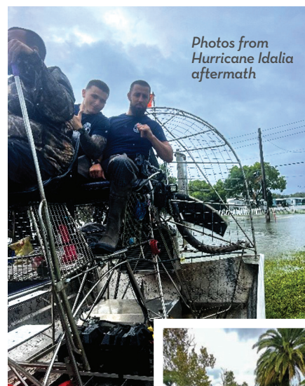
Photos from Hurricane Idalia aftermath

For more information, please review the 2025 Pasco County Disaster Preparedness Guide.