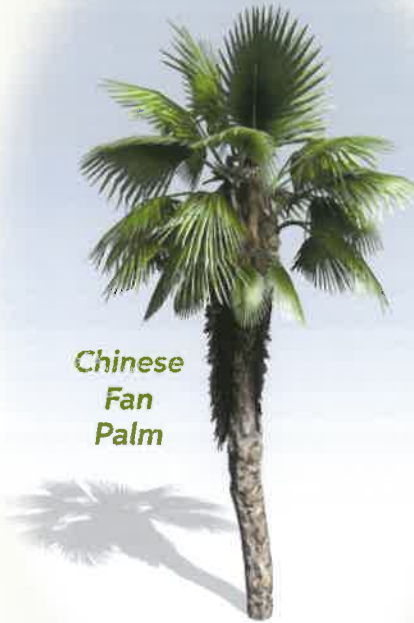
Chinese Fan Palm

▶ A landscaping project that involves the replacement of the Drake Elms in the downtown area will be started during the month of April. The Drake Elms will be replaced with Chinese Fan Palm trees. The Chinese Fan Palm tree is topped with an evergreen dense crowd of fan shaped leaves that droop down creating a fountain like effect.